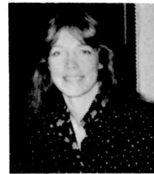
Head of Publishing and International Activities