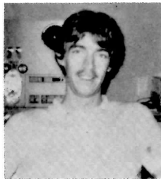
Manager of Sales and Marketing